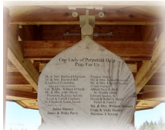
Major benefactors of the Shrine have their names engraved in the reredos behind the holy icon of Our Lady.

From Portland and Points South: Take I-5 North to exit 108. Follow the signs for College Street/St. Martin's University. Turn right onto College Street. Follow College Street for about 5 miles. At Yelm Highway (Burger King), turn left onto Yelm Highway. Go through one light and turn right at the T intersection. Stay on this road until you pass the Evergreen Valley Grocery/Gas Station (on your right). Church is 0.3 mile after the gas station and is on your left.