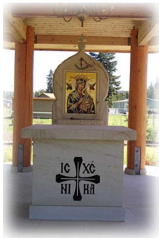
Our new stone altar